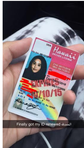
Figure 3: Temporary Paper Copy of Driver's License

They will also let you know that although you have the paper copy (which is valid for 60 days), it does not automatically mean that your photo was cleared and approved by the DMV.