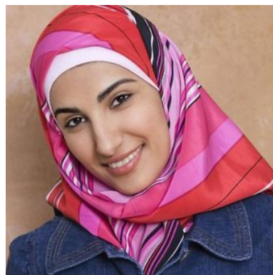
Figure 1: Woman Wearing the Hijab

While this process is not explicit to Hilo, as there are other cities and states who are required to abide by specific rules of the area, these requirements do create conflict for those individuals who are simply following their religious guidelines. The rules behind proper documentation for an individual wearing religious garments for a driver’s license photo is an ongoing ‘argument’, that will likely not be resolved at any instance of time in the near future. This is a legitimate problem in regards to the United States Constitution: First Amendment. The First Amendment states: “Congress shall make no law respecting an establishment of religion, or prohibiting the free exercise thereof; or abridging the freedom of speech, or of the press; or the right of the people peaceably to assemble, and to petition the government for a redress of grievances”. That being said, Hilo may be defying the First Amendment of the United States Constitution when requiring an individual who wears the hijab for religious purposes to provide proper documentation stating the legitimacy of the hijab. At this point, the most suitable option would be an explanation of steps in order to have the process of obtaining a driver’s license photo pictured wearing the hijab .