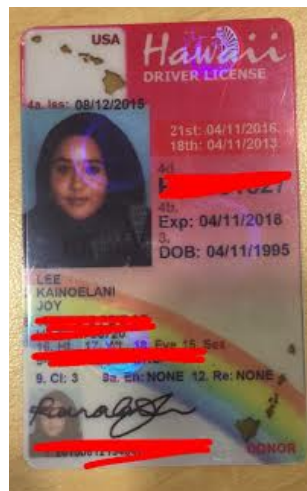
Figure 4: Permanent Hard Copy of Driver's License

You will not know if your photo is approved until you receive the hard copy in the mail. The hard copy of the Hawaii driver’s license will be sent via mail to the address you provided. If you are in a hurry to obtain your driver’s license wearing the hijab due to circumstances such as traveling, be sure to go at least a month in advance, or you may not receive your driver’s license in time.